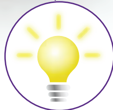
QuiltMaster™ LED lighting: throat, needle, and bobbin