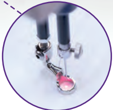
Pinpoint needle laser