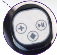
Independently-adjustable handlebars with programmable buttons