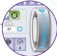
On-screen hand wheel

Twenty inches of creativity at your fingertips.